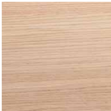
BLEACHED LIGHT OAK VENEERED PAINTED