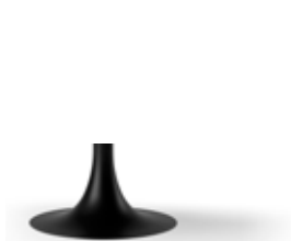
Gamba a cono attesa altezza 32 cm Cone base h. 32 cm Pièd. tulipe haut. 32 cm Tellerfuß H. 32 cm