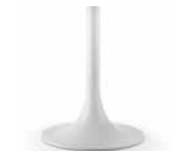
Gamba a cono altezza 74 cm Cone base h. 74 cm Pièd. tulipe haut. 74 cm Tellerfuß H. 74 cm