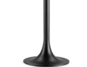
Gamba a cono altezza 100 cm Cone base h. 100 cm Pièd. tulipe haut. 100 cm Tellerfuß H. 100 cm