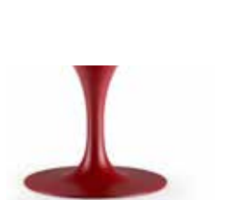
Gamba a doppio cono altezza 74 cm Double-cone base h. 74 cm Pièd. double tulipe haut. 74 cm Doppel Tellerfuß H. 74 cm