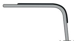
XH005 - uph. pad